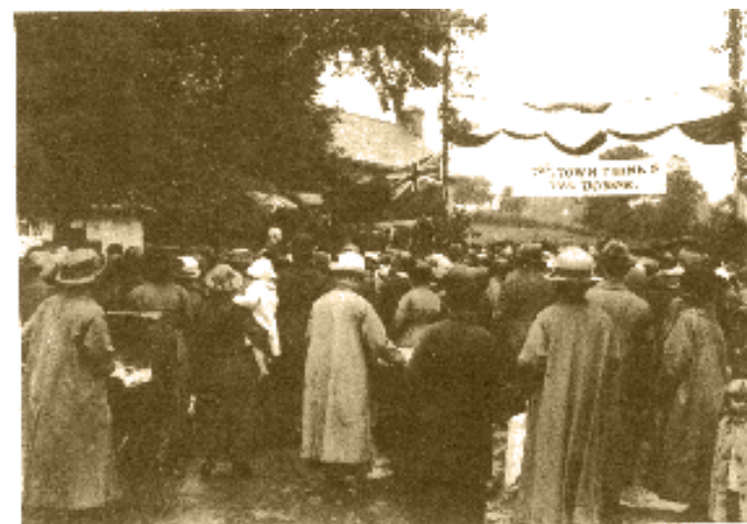
The people of Camelford at the opening of the park in 1922 from the Camelford History & Archive Trust.

The park was officially opened in August 1922. He named it Enfield Park because of his business success in "one of the most beautiful spots around London". Apparently the opening ceremony was the largest function since the Coronation (1911) owing to free tea being given to children, and the large attendance .